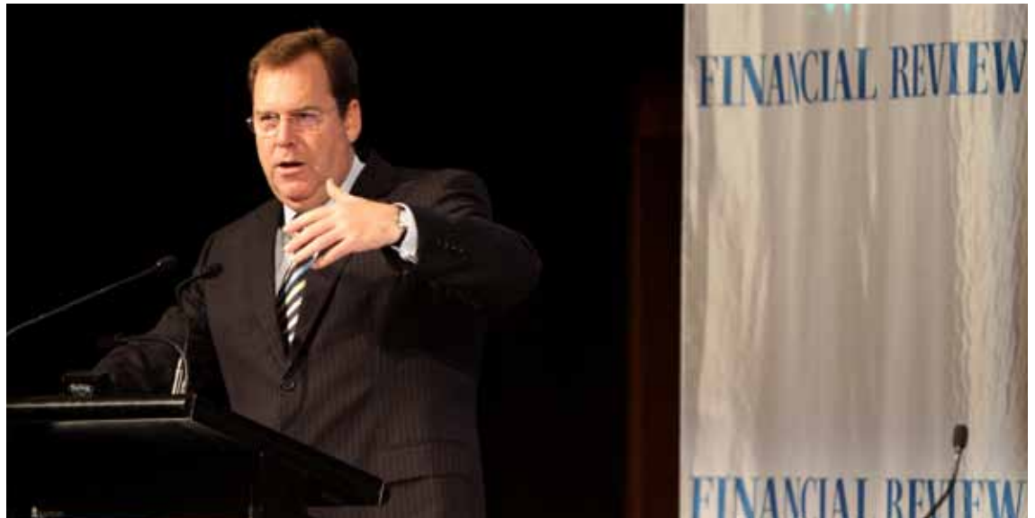
Attorney General of Australia, the Hon Robert McClelland announces his recommendation that ACICA be nominated as appointing authority under the new Act.

On 13 April, the Centre will host the launch of a new publication International Commercial Arbitration (Thomson Reuters). Authored by one of ACICA's