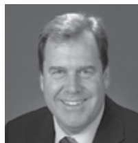
The Hon. Robert McClelland MP, Federal Attorney-General