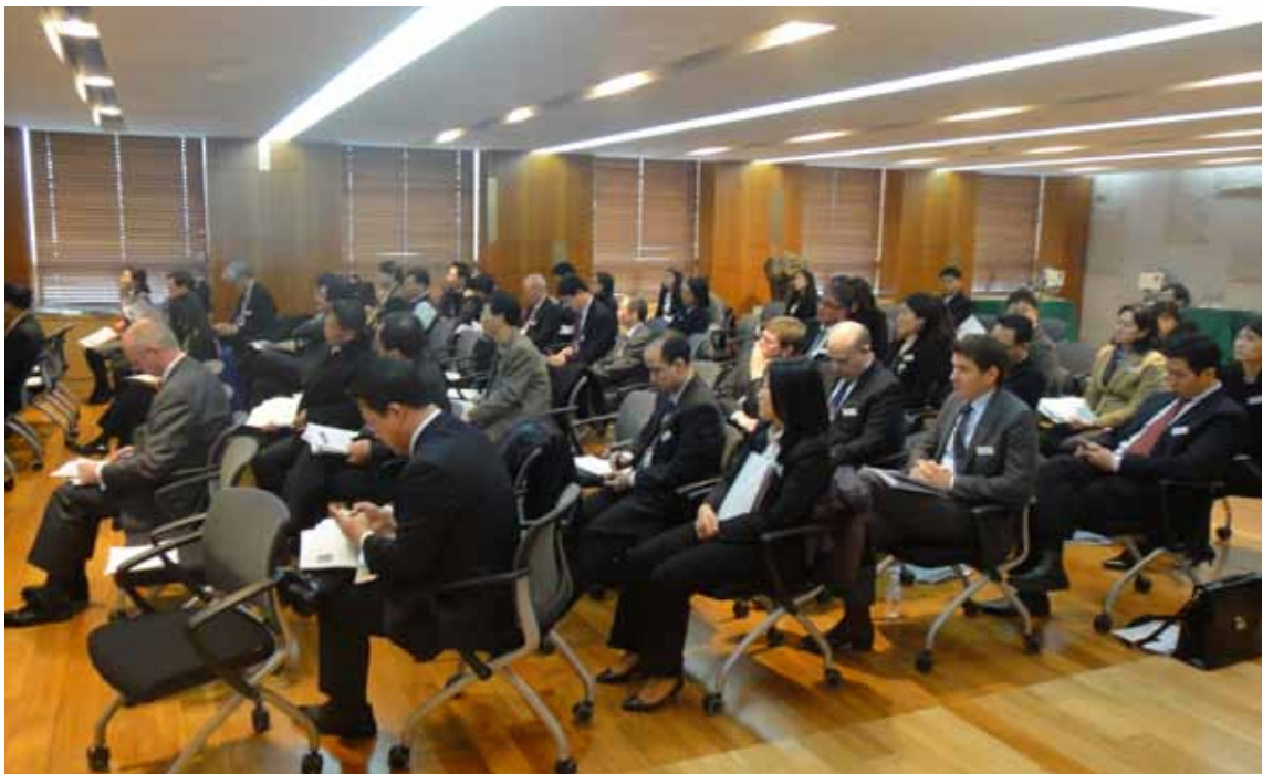
Corporate in-house counsel, corporate executives and legal directors of major law firms in Korea.